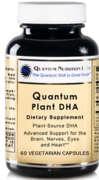
Available in powder and capsules

Quantum Greens is nature's amazing super nutrition formula for optimal health and vitality. Our prized greens blend features our pristine Power Grass-Plus Blend™ (low-temperature, air-dried young grasses) coupled with Power Greens Blend™ for optimal nutritional effect.