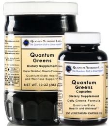
Available in powder and capsules